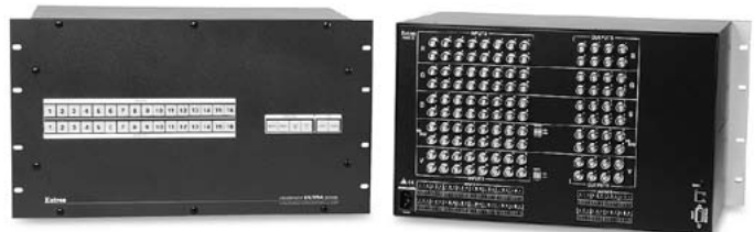
CrossPoint Ultra 168 HVA