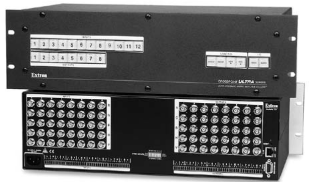
CrossPoint Ultra 88 HVA