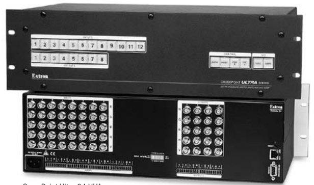
CrossPoint Ultra 84 HVA