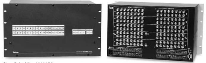
CrossPoint Ultra 1616 HVA