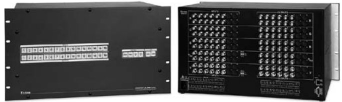
CrossPoint Ultra 1212 HVA